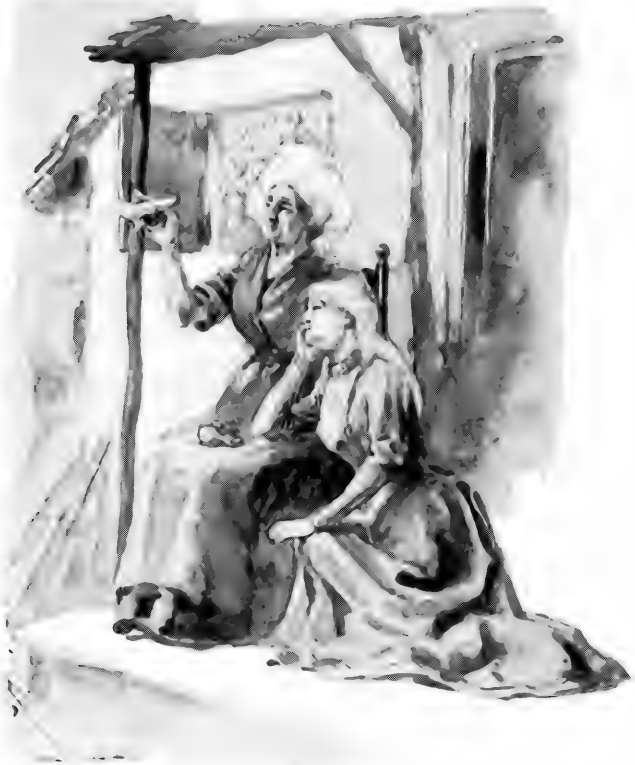
"'SER, MOTHER, DEAR,' SHE SAID, 'WHAT I HAVE FOUND.'"—Page 270.